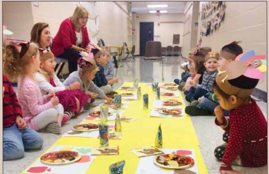
On Sunday, November 20, the Sunday Preschool classes had their Thanksgiving feast. They made placemats, turkey headbands, shared something they were thankful for with one another, and enjoyed a plate of snacks.