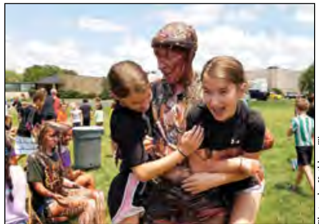
On the last day of Totus Tuus Day Camp at SFA, the kids once again enjoyed the opportunity to turn their leaders into a human sundae!