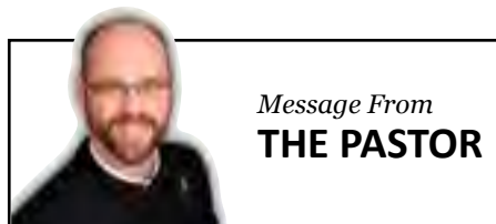
Message From THE PASTOR

washes away our sins, enters us into the life of the Trinity and makes us a part of the family of the living God. After baptism one is anointed with the oil of Confirmation , which is a fuller outpouring of the Holy Spirit that confirms us as witnesses to the resurrection of Jesus.